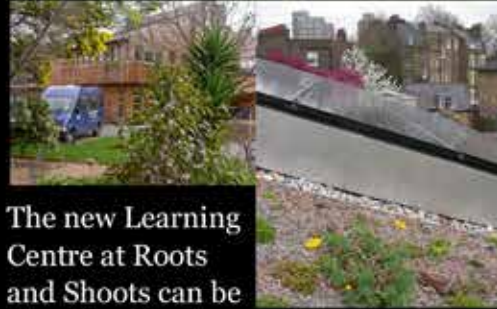
The new Learning Centre at Roots and Shoots can be hired for Meetings and Conferences