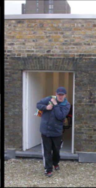
In the classroom.....work experience.....preparing ground for turfing.....for vegetables on the allotment.....decorating and stocking the new shop